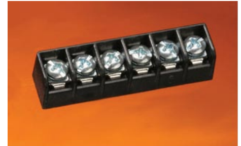
Single-Row Tri-Barrier Terminal Strip

Durable tri-barrier terminal strips are available with PC tails, our most popular terminal style, to accommodate a wide range of design requirements